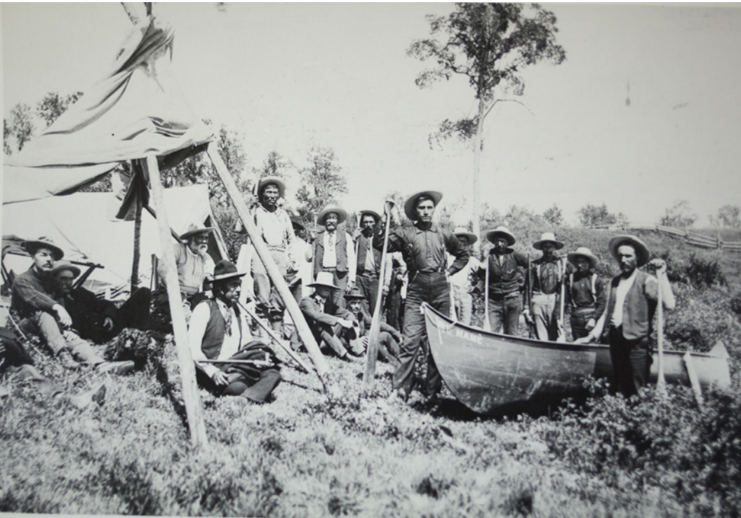
July 1901. Treaty Time, Little Forks, Rainy River.